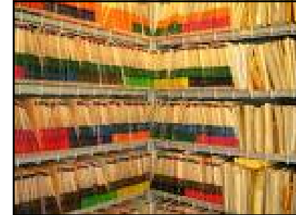
Image & Document Scanning Services For a Digital World